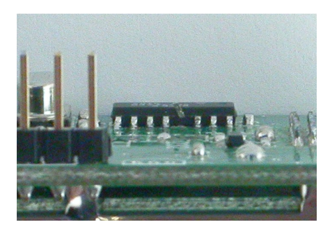
Figure 3: Pin 13 of SP232AEN IC lifted